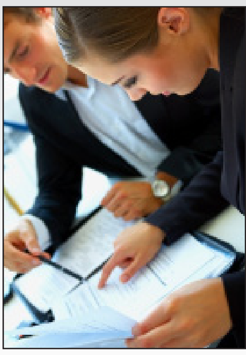
They Buy From Us. They'll Buy From You.